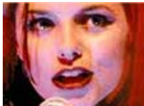
All Men Are Liars